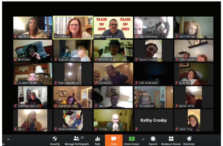
Zoom meetings - we continued to have great conversations with our students.