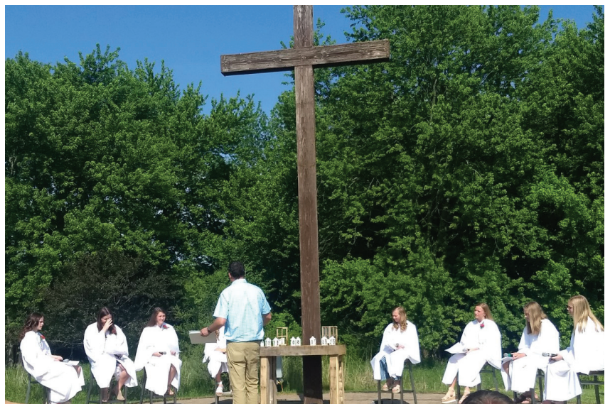
Confirmation Service - Saturday, June 6