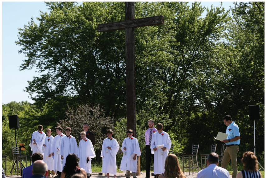
Confirmation Service - Saturday, June 6