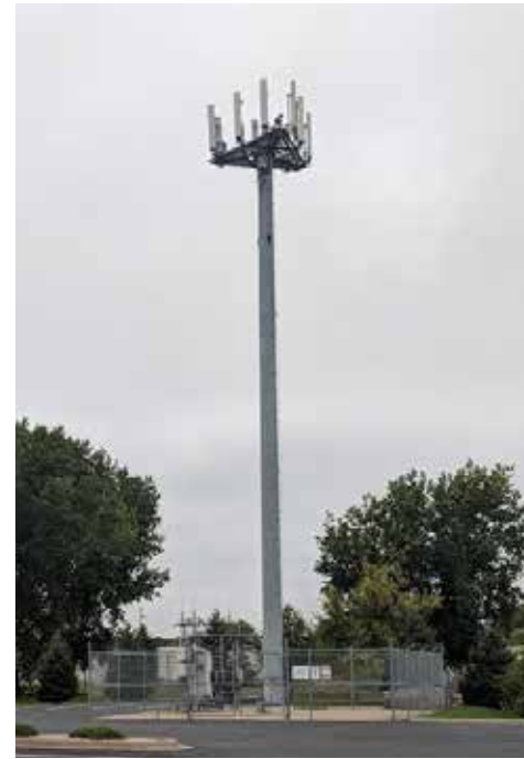
ABOVE: rendering of a monopole