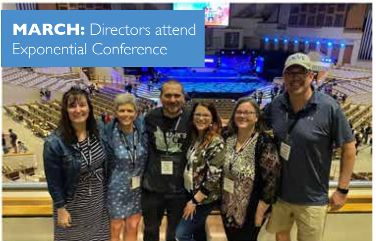
MARCH: Directors attend Exponential Conference