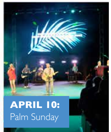
APRIL 10: Palm Sunday