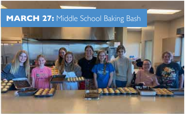
MARCH 27: Middle School Baking Bash