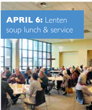
APRIL 6: Lenten soup lunch & service