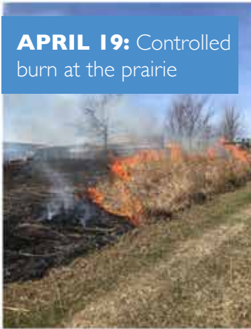
APRIL 19: Controlled burn at the prairie