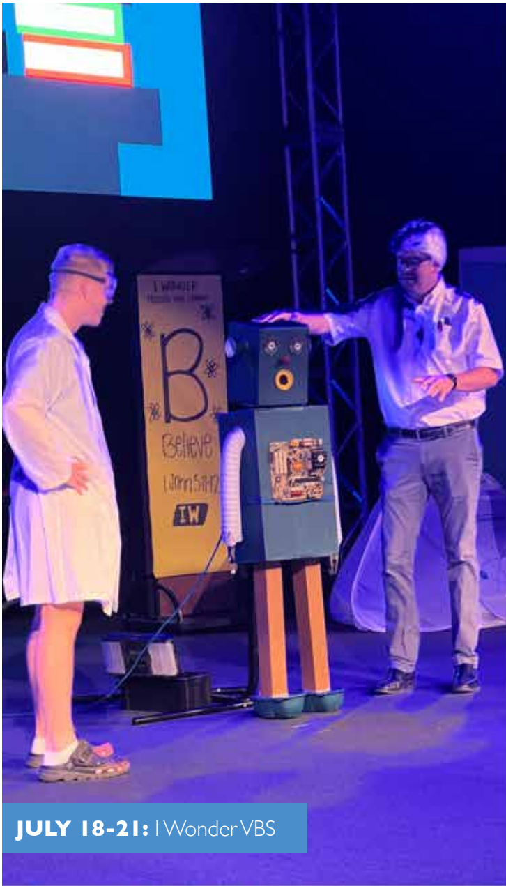
JULY 18-21: I Wonder VBS