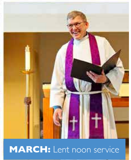
MARCH: Lent noon service