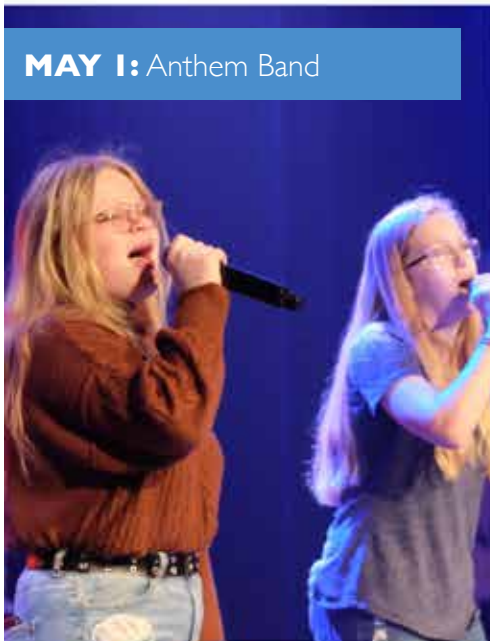
MAY 1: Anthem Band