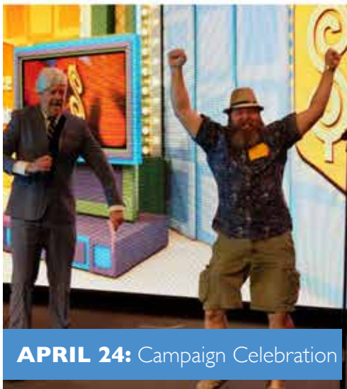
APRIL 24: Campaign Celebration