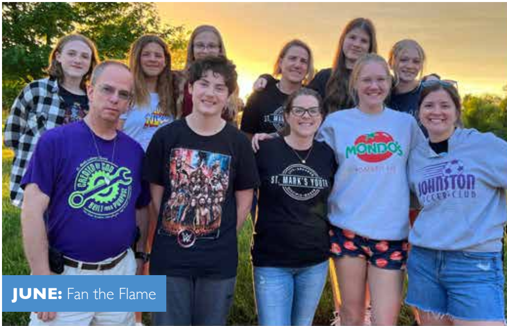
JUNE: Fan the Flame