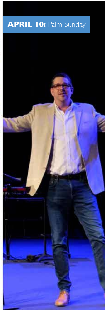
APRIL 10: Palm Sunday