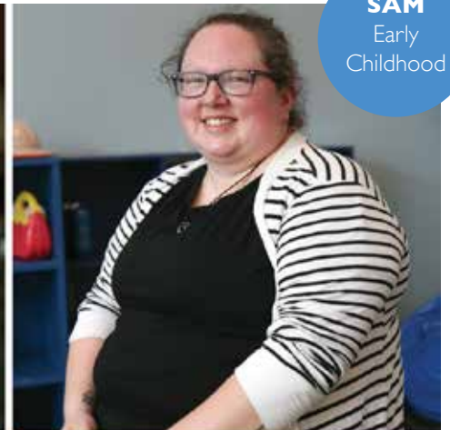
SAM Early Childhood