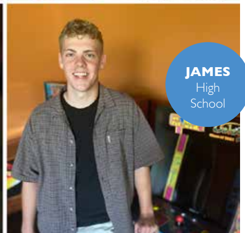
JAMES High School