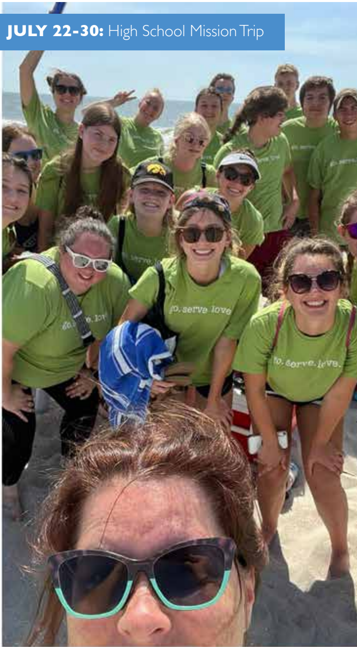
JULY 22-30: High School Mission Trip