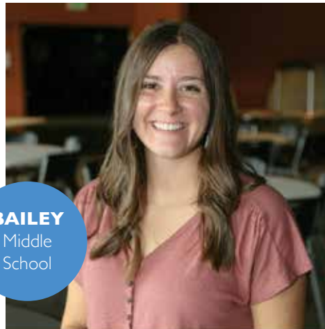
BAILEY Middle School